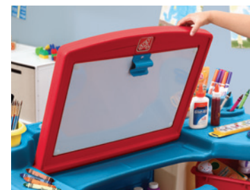
Design and colors may vary