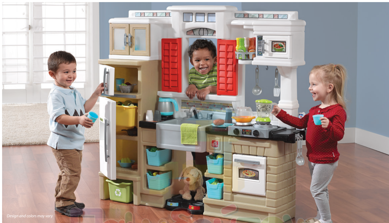
Design and colors may vary