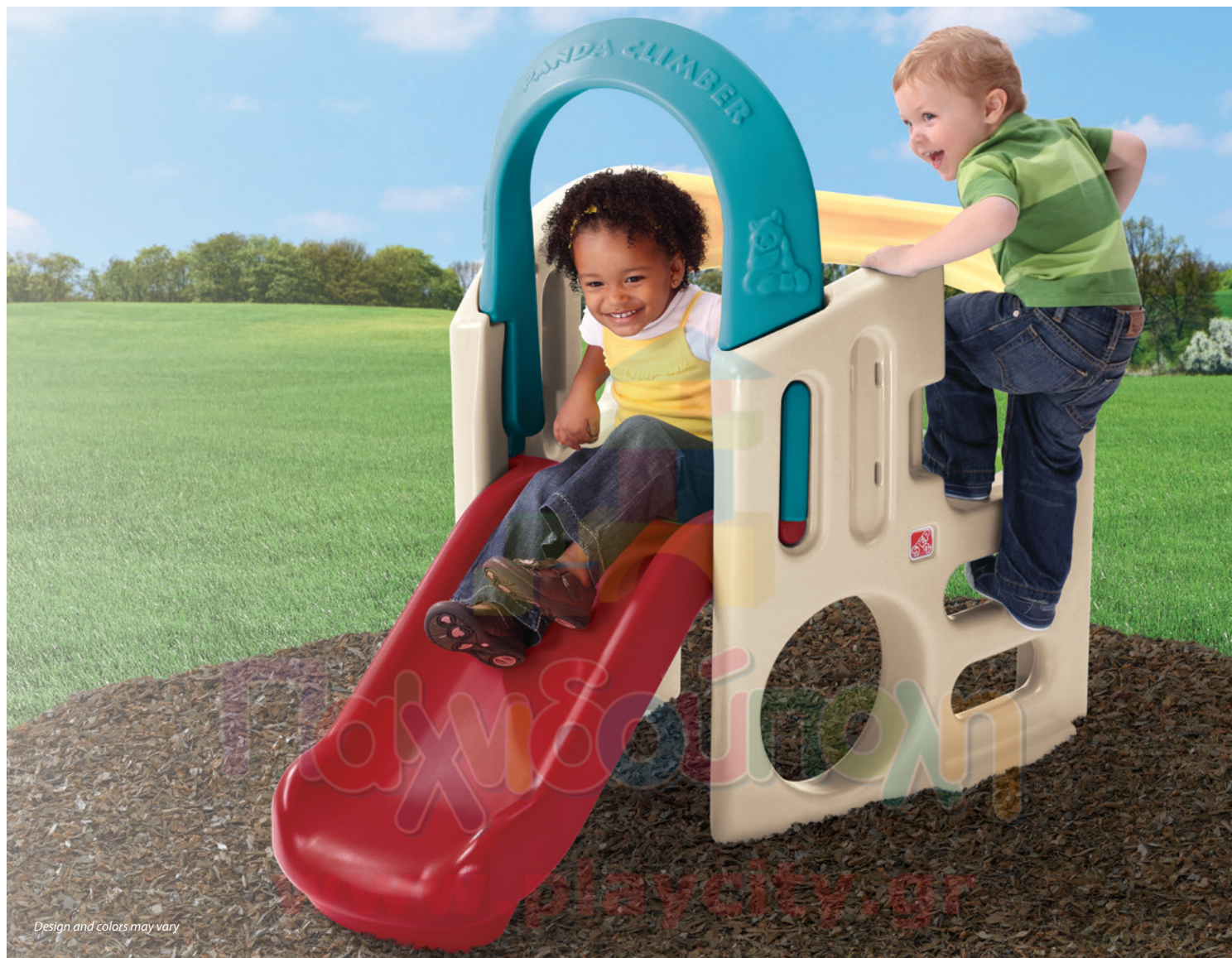
Design and colors may vary