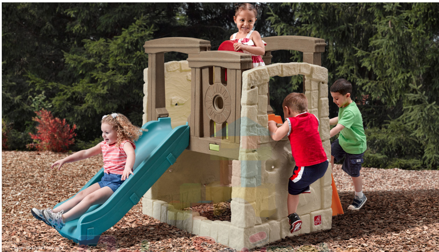
Design and colors may vary.