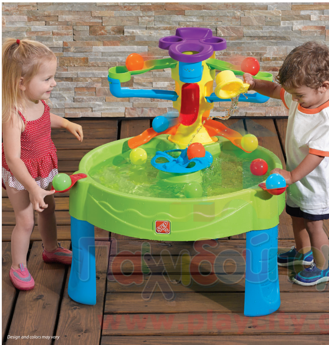
Design and colors may vary