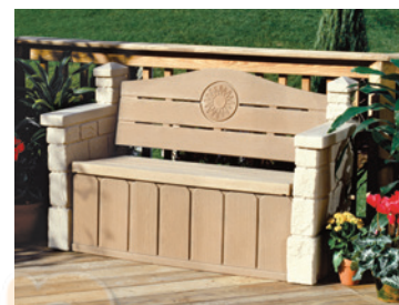
Design and colors may vary